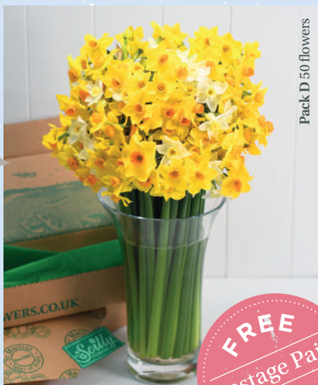
Pack D 50 flowers